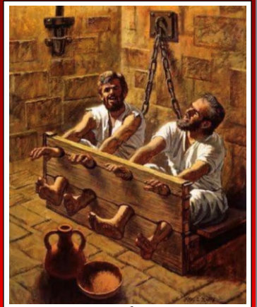
St. Paul & St. Silas